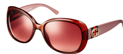
Gucci Optical #56093 ($440, members $352)

If you need prescription sunglasses but have already written off those beloved Prada or Gucci sunnies you spied a few weeks ago, think again. You have a plethora of choices, though you do need to take a few key aspects into consideration when browsing.