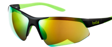
Bolle Optical #56291 ($220, members $176)

Yuji explains one of the main restrictions is the size of the frame. "Depending on the individual's prescription, as well as their facial features, if the sunglass frame is too big then the prescription lenses may not be able to be inserted within that frame," he says.