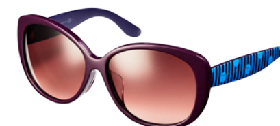
Marc by Marc Jacobs Optical #53941 ($240, members $192)