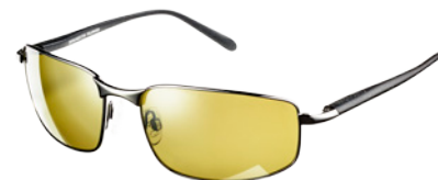
Serengeti Optical #42941 ($380, members $304)